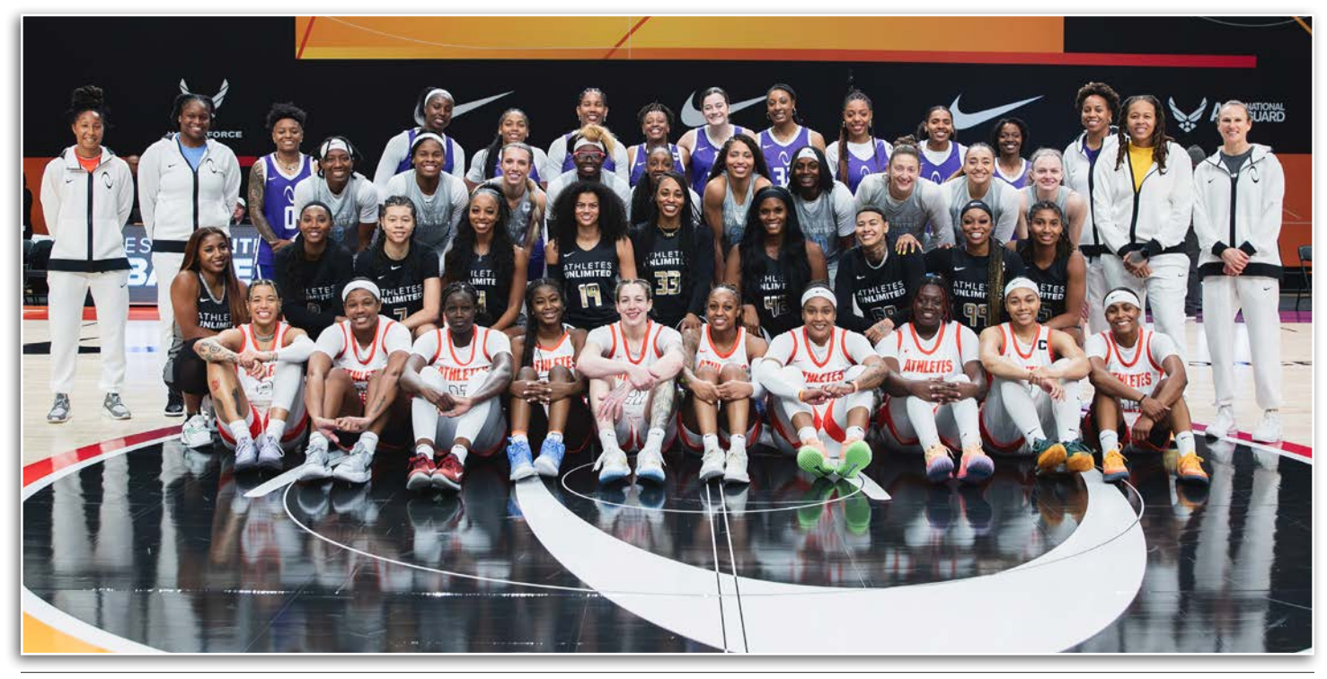
WORLD-CLASS TALENT. PLAYOFF INTENSITY.