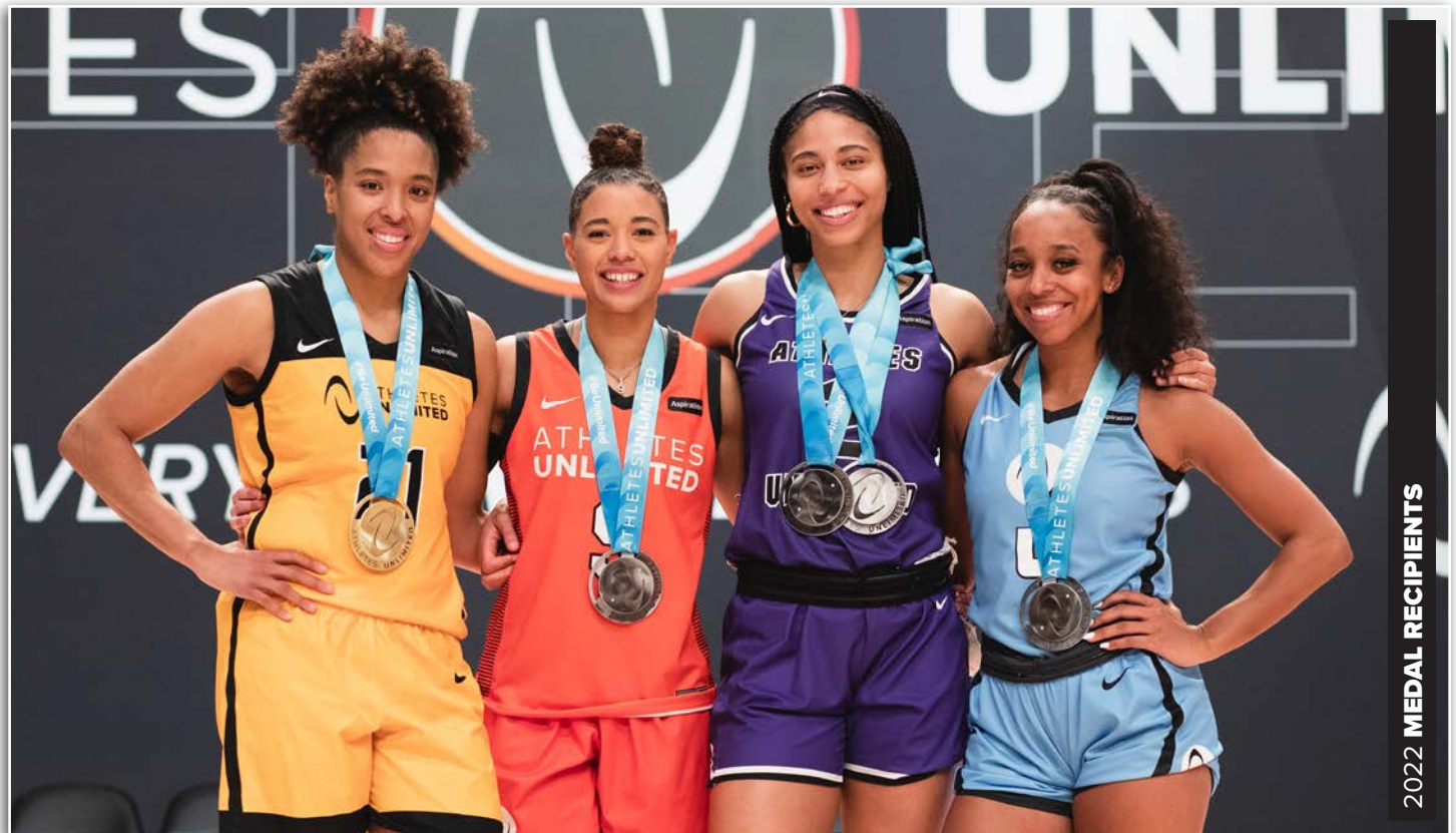
2022 MEDAL RECIPIENTS